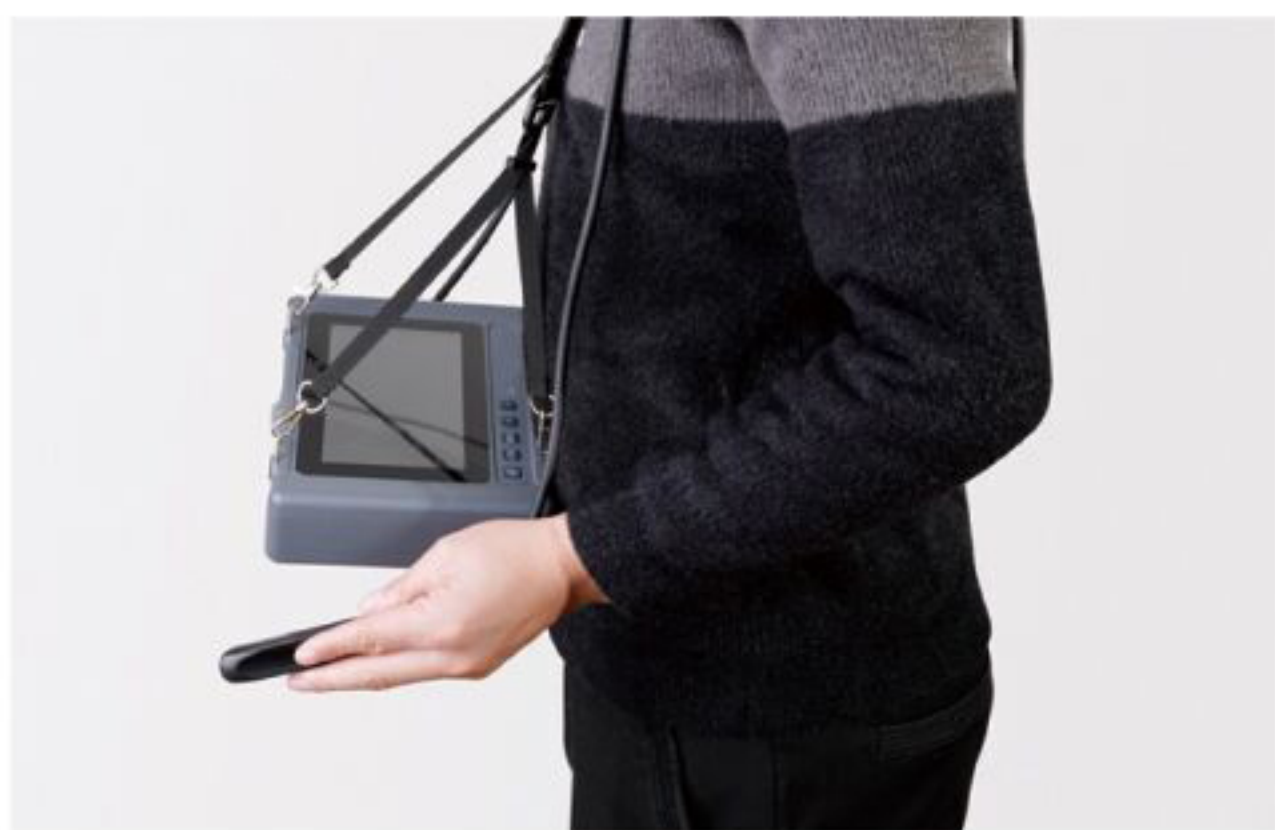
Strap-type design makes the operator more convenient and comfortable