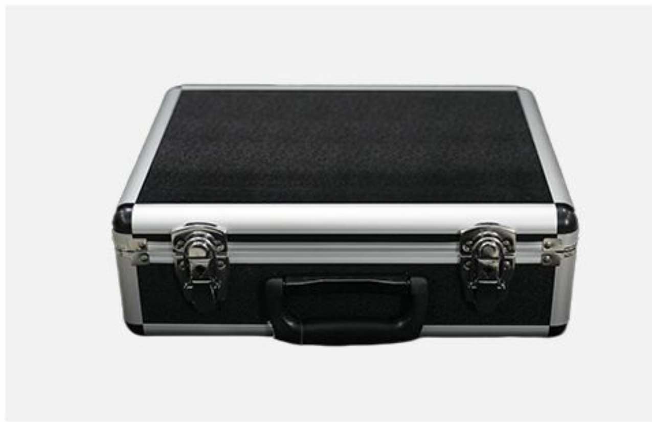
Environmentally friendly and lightweight Aluminum-plastic packaging case