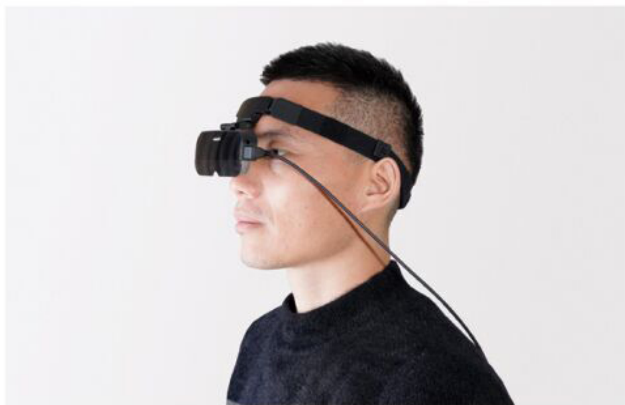
Optional video goggles for ultimate viewing experience